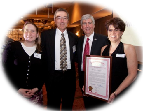
Habitat staff with Governor Rick Snyder